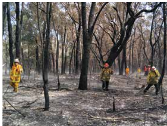
The fireground is a tragic sight to rescuers searching in hot conditions and dangerous terrain.

Koalas which have been burnt are dehydrated and in significant stress. When they arrive at the Hospital they are given fluids and 24 hours of peace and quiet in our Intensive Care Unit. Following that, under anaesthetic, the koalas' injuries are assessed, wounds are thoroughly cleaned, burn cream (the same medication as used on human burns) is applied, then soft padding and bandages. They are also offered a formula feed twice daily, which helps support their recovery. The wounds are re-dressed every 3 days for many weeks. They will remain in care for six to nine months, until their injuries are healed, but also until their habitat has regenerated sufficiently to sustain them again.