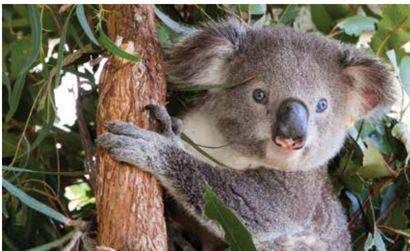
Lion Leo is Ambassador for Koala Smart and has stunning blue eyes.

Koalas from the recent bushfires are also now available for adoption.