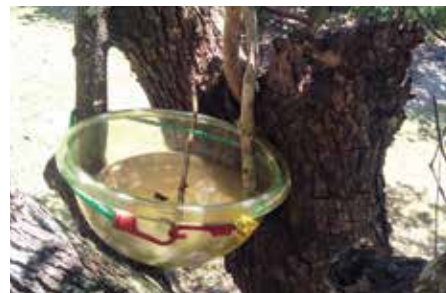
This water bowl secured in a tree provides water for all wildlife. Note the stick which enables small animals to get out, if they fall in.

*You can find out which species of tree your local koalas eat by contacting your local Landcare group.