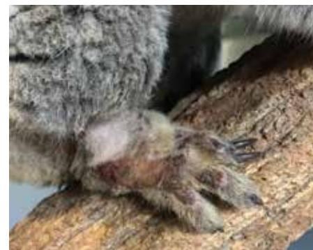
Wazza's drag injuries, healing well.

Hopefully there will be lots of 'super joeys' from this 'super koala' well into the future.