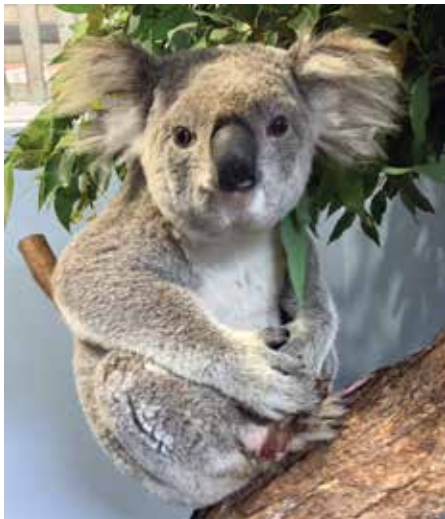
Wazza in the Intensive Care Unit, after her bandages were removed. Drag injuries are visible on her right foot.