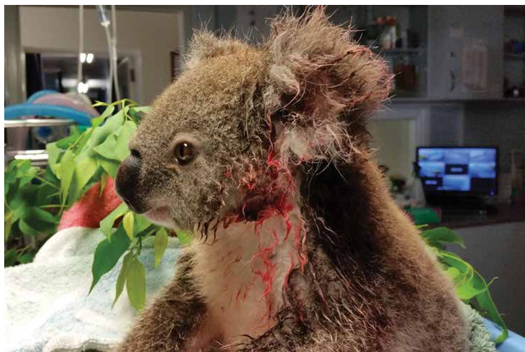
A joey admitted to the Hospital, infested with ticks.

As the climate changed on the Australian continent, eucalypt trees began to appear and evolved to cope with the drier climate. Koalas have existed in various forms for the last 5 million or so years. Koalas also have evolved to occupy the eucalypt forests and live on a diet of its foliage. Koalas to this day cannot survive without eucalypt trees.