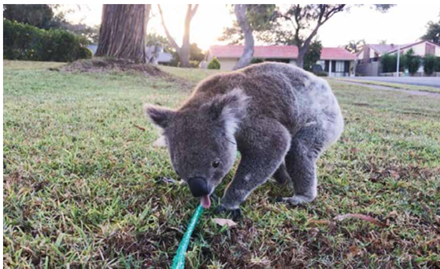
A thirsty koala laps water from a garden hose.

Fast forward to the present day, and we now have strong evidence that climate change and increased intensity and duration of drought conditions in many areas of the koala's range, are unfortunately causing significant challenges - on top of other issues such as deforestation and habitat destruction. Recent research is now indicating declines in important koala populations owing to drought, decreasing water levels