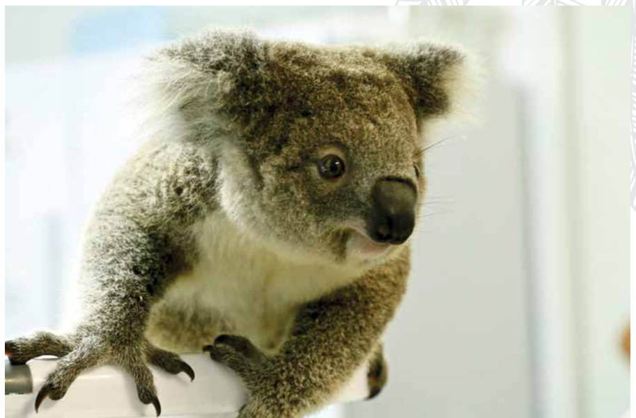
Kooloonbung Tasha, who has recovered well from tick infestation after several weeks of treatment and home care.