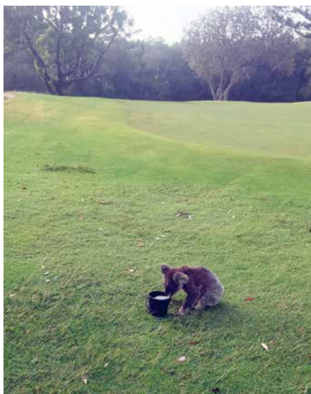
A divot bucket of fresh water provides a welcome drink.