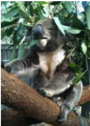
Salamander Bay Tallimba, just resting on his gunyah and enjoying a few gum leaves in the Port Macquarie sunshine.