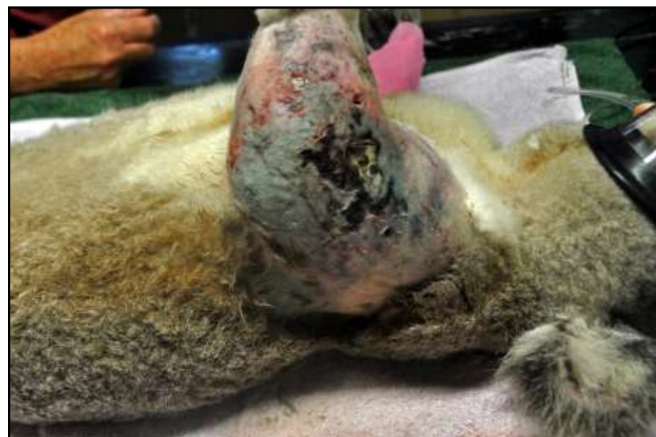
A young male found some days after the attack. Severely traumatised left arm which was not only badly infected but the humerus and elbow joints were fractured. This koala did not survive.

The koala wishing to go to various trees within his or her range will either go by the quickest route – down the tree along the ground and up the next tree. Or along a fence line to access whatever tree they are seeking. The koala meets up with the family dog on the ground, or sadly they are often pulled off of the top of fences by big dogs.