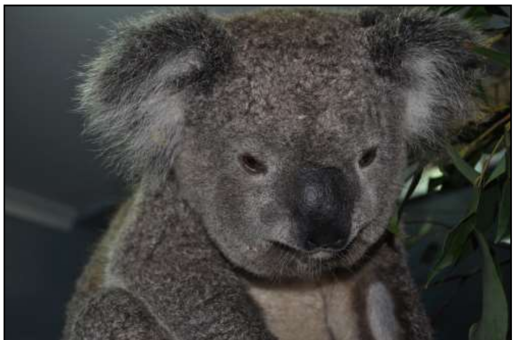
This young female koala who was grabbed around the neck and suffered quite severe bruising and swelling - she was successfully released.