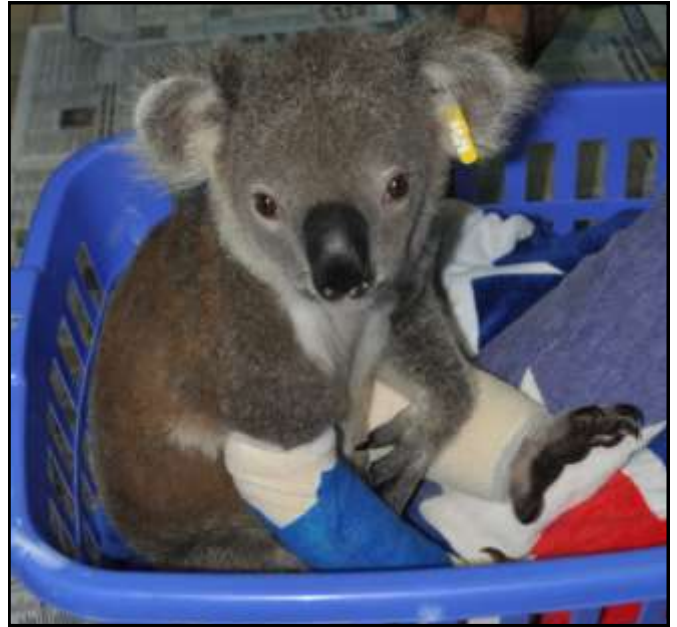
Zali still a little dazed after first being admitted.

quite frightened, which is perfectly OK by us as we leave him alone as much as possible. Let's hope he has been released to his home by our next issue.