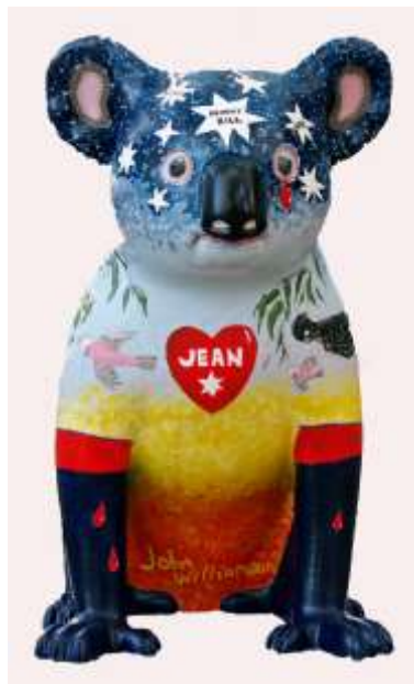
Koala Trail Icon "Sunshine"

Licensed to rehabilitate and release sick, injured and orphaned native fauna under Licence No. 10044