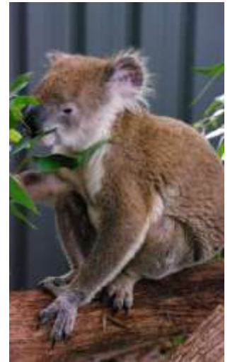
Maria River Road Ian at feeding time "Remember focus, chew gum leaves and keep your balance!"