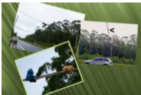
Our rescue team responded to a call for two stranded koalas on the rope bridge 20m above the Oxley Highway. The only trouble, it was April 1st.