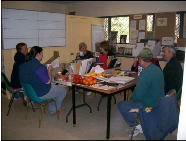
Photo of some of the Wednesday morning crew at morning tea.

Morning tea is a very, very important ritual at the hospital, where everything and anything is discussed, and all the latest recipes are tested out on willing guinea pigs.