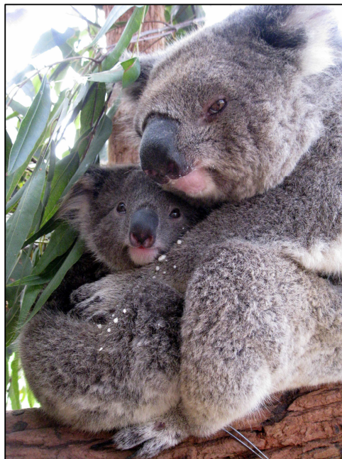
Bonny Fire and joey Bonny Blaze

The hospital is certainly looking ship shape and tidy – the gardens are really starting to bloom. It's very encouraging when the public continually remark how tidy and well kept the whole place is. It's a credit to all the voluntary team. It still never fails to amaze us all how we coped for so many years in the tiny cramped conditions of the old hospital – we love the new one so much!!!!