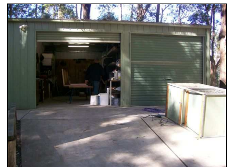
The Wednesday morning maintenance teams "office". This is where all the action goes on.